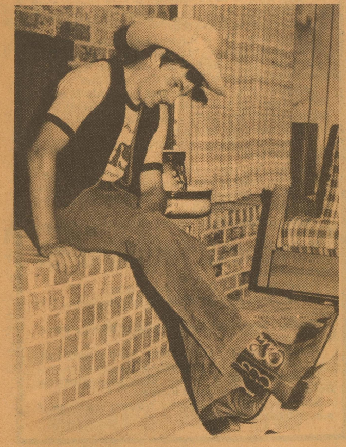
BOOTS HAVE DIFFERENT FIT ... Hard for Frenchman to get used to