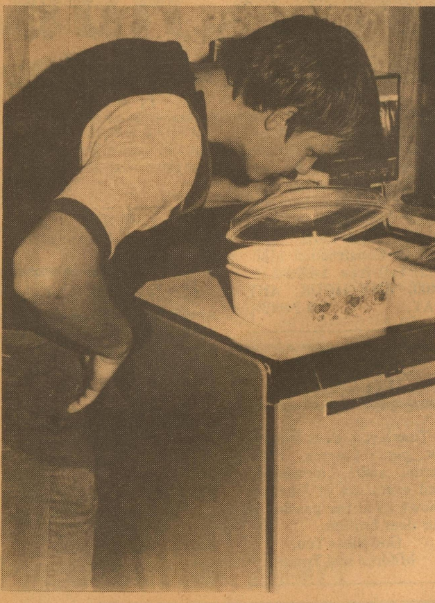
AND WHAT DO YOU CALL THIS? ... "They eat mostly meat here"