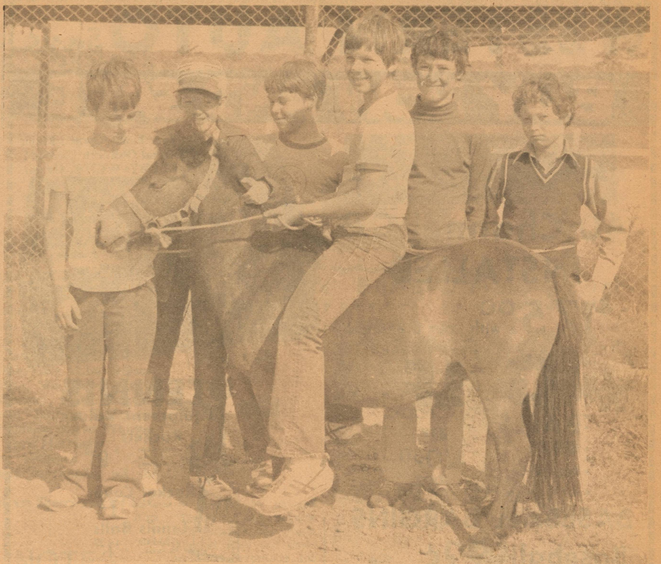
NO HORSN' AROUND--These Eldorado youngsters showed up at Legion Field last Saturday morning to help with the

The Council did not make any final decision. But the discussion SEE City Council p.5