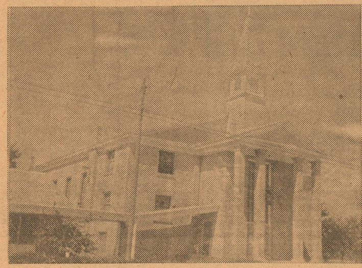
—75th Anniversary Celebration Schedule—