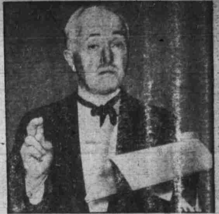
John Masefield, England's poet laureate, shown as he paused at Los Angeles during a speaking tour to deliver a tribute to the late King of England, George V. Masefield was made poet laureate by King George May 10, 1930.