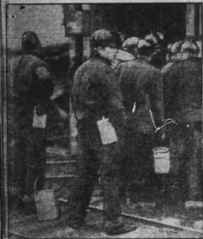
Here a rescue crew is shown entering the Monarch mine at Louisville, Colo., seeking eight men trapped underground. Two bodies were recovered and hope was abandoned that the others would be found alive. The miners followed an old tradition that rescue work must not cease until entombed fellow workers are reached.