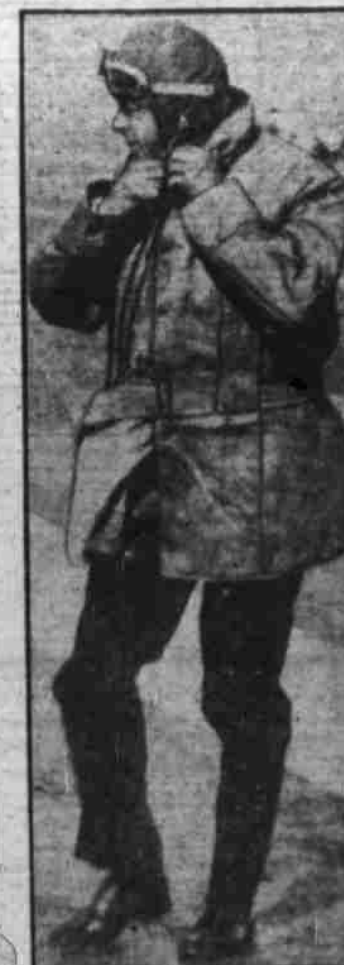
King Edward VIII, Great Britain's new ruler flew from Sandringham, where his father-king died, to London to take up his duties of state—the first British monarch to ride in a plane. A skilled pilot, he is shown, when as the Prince of Wales he donned flying togs for a review from the air.