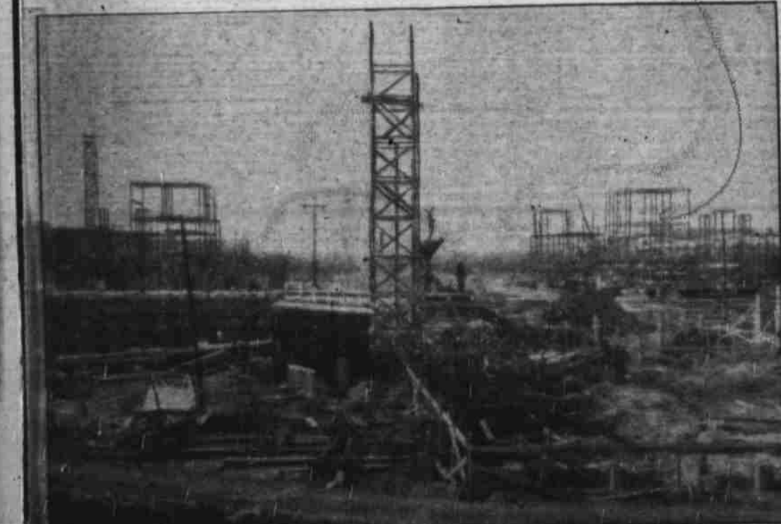
An army of 2,400 workmen is tearing around the clock at Dallas in order to complete buildings for the $25,000,000 Texas Centennial exposition for the June 8 opening. As laborers excavated for the $1,200,000 Hall of State, steel workers throw up framework for the Varied Industries building (left) and the Petroleum Building.