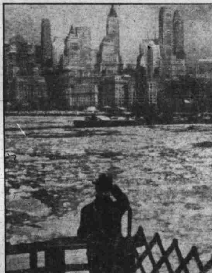
Traffic in New York harbor was delayed and many Atlantic liners had to wait several hours before docking as ice and slush jammed the harbor. The port is shown virtually deserted in this striking picture, looking toward Manhattan Island and the world-famous skyline.