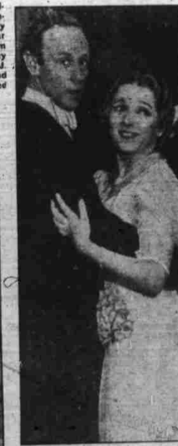
Douglas Fairbanks returned from Europe as time drew near for recording the final divorce decree obtained by his wife, Mary Pickford, but the actress appeared unconcerned. Here she is shown dancing with Leslie Howard, British actor, at a party at Pickfair, her home near Los Angeles.