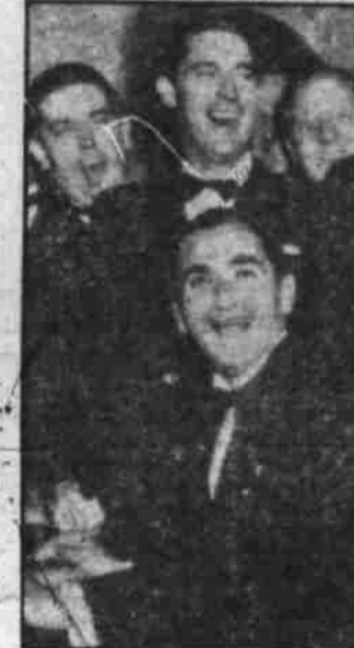
Irving Berlin celebrated his twenty-fifth year in popular music, dating from the time he wrote "Alexander's Ragtime Band," at Hollywood. He is shown, at the piano, with some well-wishers.