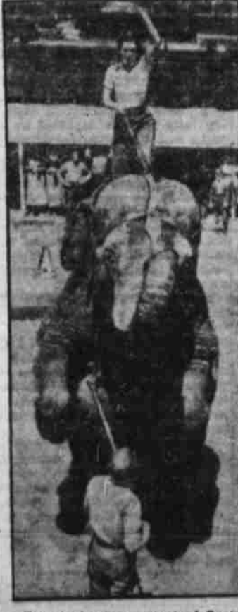
The elephants are coming! Spring training for the circus manager is over and here's Myrtle, the elephant, on her heels for a final dress rehearsal as circus breaks up camp at Sarasota, Fla., for the tanbark trail.