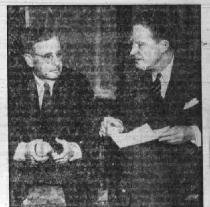
Gov. Alf M. Landon of Kansas (left), shown as he conferred at Topeka with John D. M. Hamilton (right), for the first time since Hamilton became national organizer for supporters of the governor for the Republican presidential nomination. Hamilton is Republican national committeeman for Kansas.