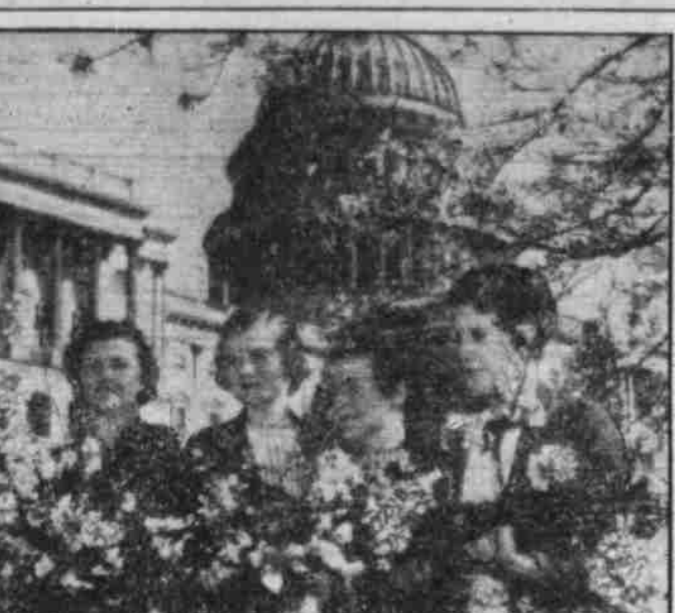
Washington's first cherry blossoms, aided by mild weather and steam pipes at the foot of the tree, have appeared on the scene at the nation's capitol. Here are congressional secretaries admiring the blossoms.