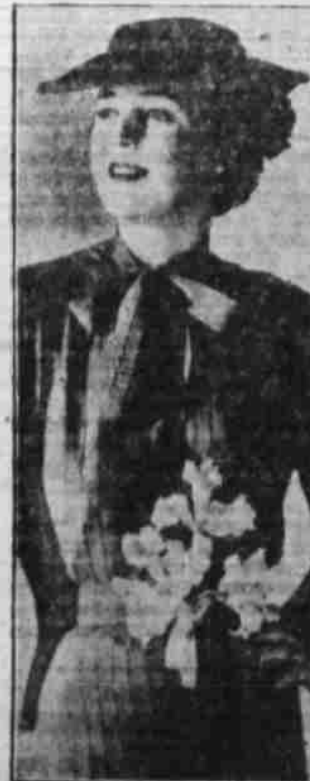
Pale lavender orchids complete this new smart spring afternoon frock of tucked violet chiffon made over a taffeta slip. The dress, designed with a tie neckline and loose, short sleeves, is worn with a hat of black straw.