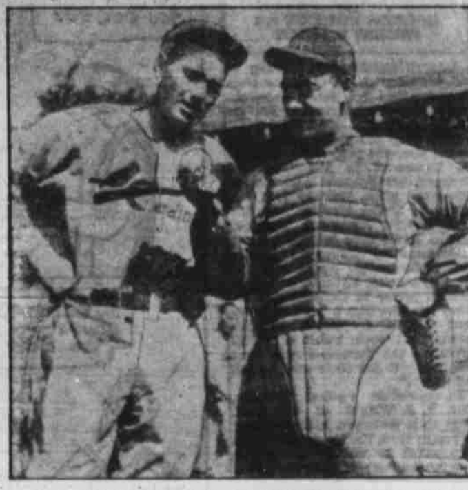
When Virgil (Spud) Davis, St. Louis Cardinal catcher (right), landed in camp at Bradenton, Fla., his threatened sock for Dizzy Dean didn't materialize and the meeting turned out to be more of a love fest. The dizzy one (left), was quoted as objecting to pitching to Davis, but apparently has withdrawn his objection.