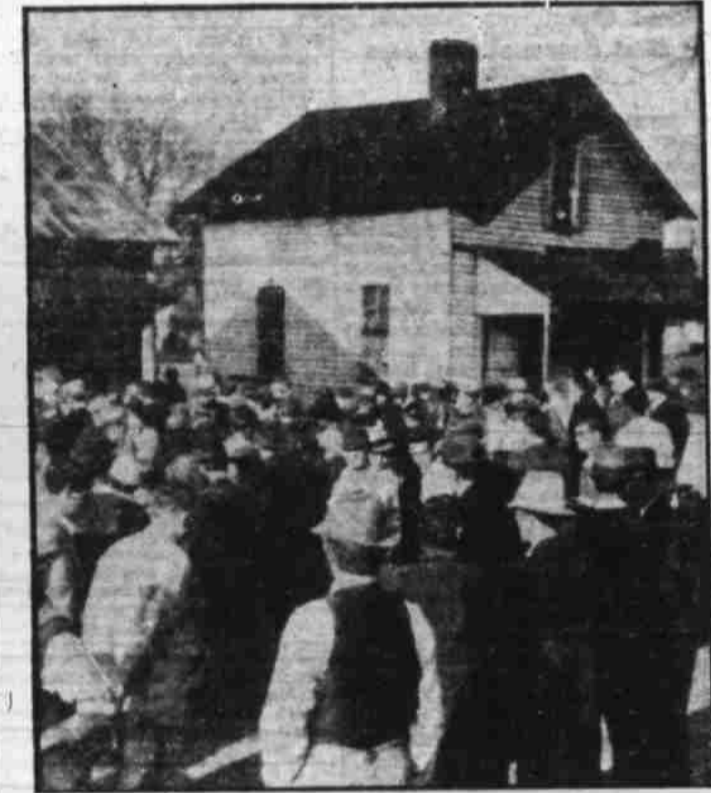
Four Negroes, arrested in the savage, fatal attack on Vivian Woodward at Huntville, Ala., were rescued by officers from angry citizens who seized them after bloodhounds followed a trail to their home. This picture shows a crowd milling about the Negroes' home.