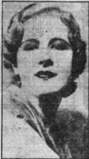
Marilyn Miller, star of "Sonny" and other musical shows, was reported seriously ill in a New York hospital where she had gone for a rest.