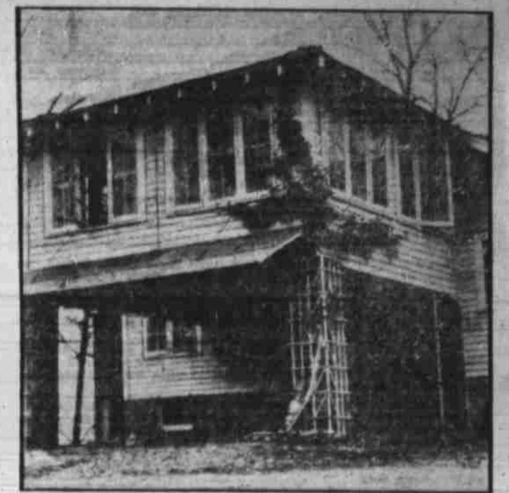
Although the federal bureau of investigation remained silent after a sudden raid on a hilltop farmhouse (above), near Hot Springs, Ark., rumored to be the hiding place of Alvin Karpis, notorious gangster, Hot Springs police said the raid was unsuccessful. G-men surrounded the house, threw tear gas bombs inside, and then occupied it.