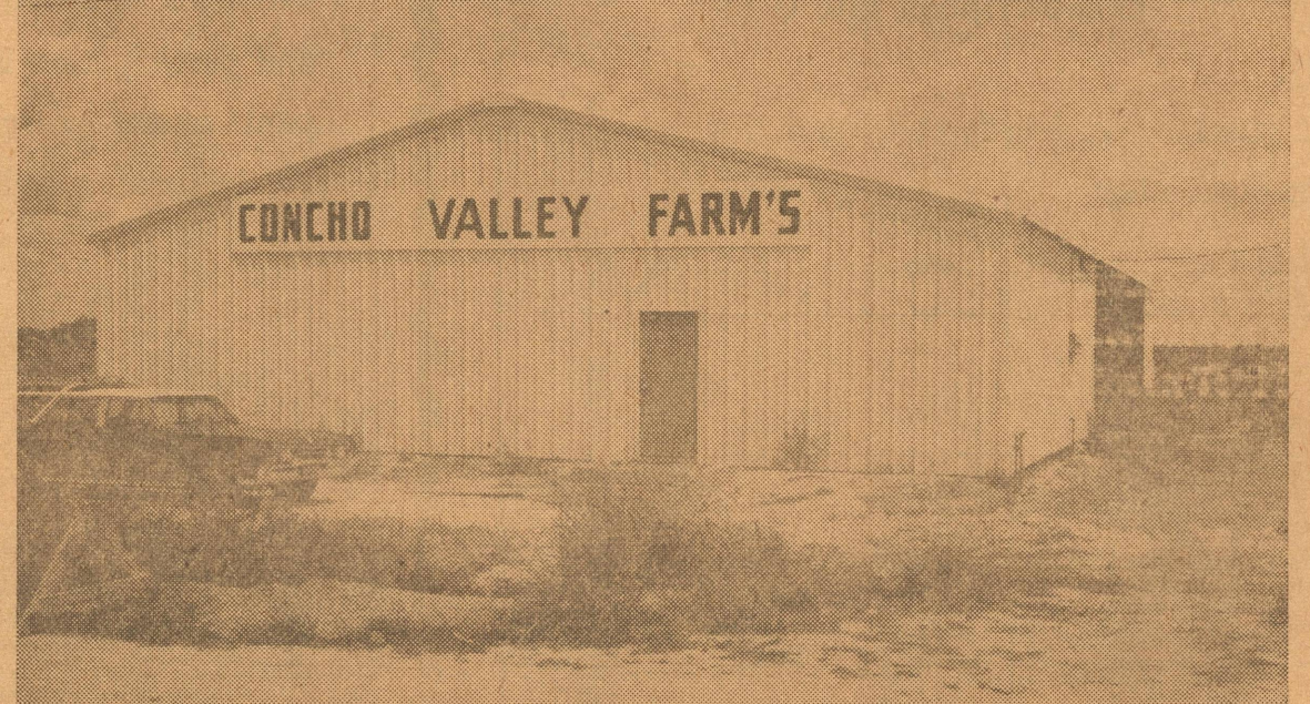
USUALLY A BUSY PLACE, the Butlers' packing building had cucumbers and collard greens being put up this week, and then shipped out. The building shown houses a large cooling room where some vegetables are stored prior to shipping, along with offices.