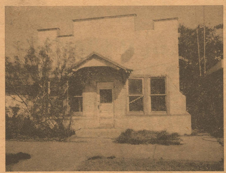
WRECKING has started on this old building on the Angelo highway. It was built about 40 years ago as Wiedenmann clinic. It is located between Shaw's Motel and the Meador-Peters Agency office building.