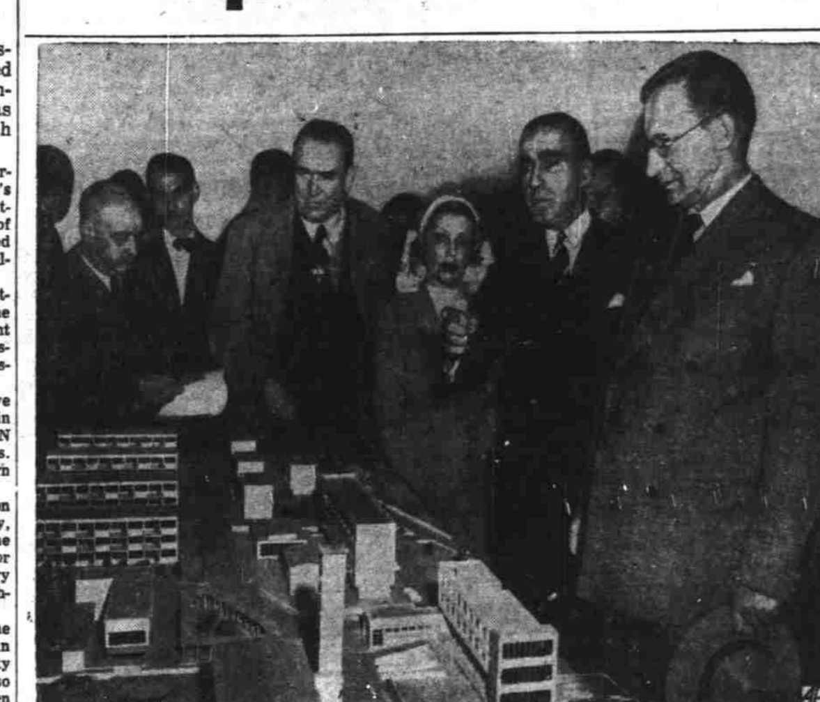
RECOVERY EXHIBIT—Italian Premier Alcide De Gasperi (right) and James C. Dunn, U. S. Ambassador to Italy (pointing), look over model of a housing project at an exhibit explaining European Recovery Program at Colonna Gallery in Rome.