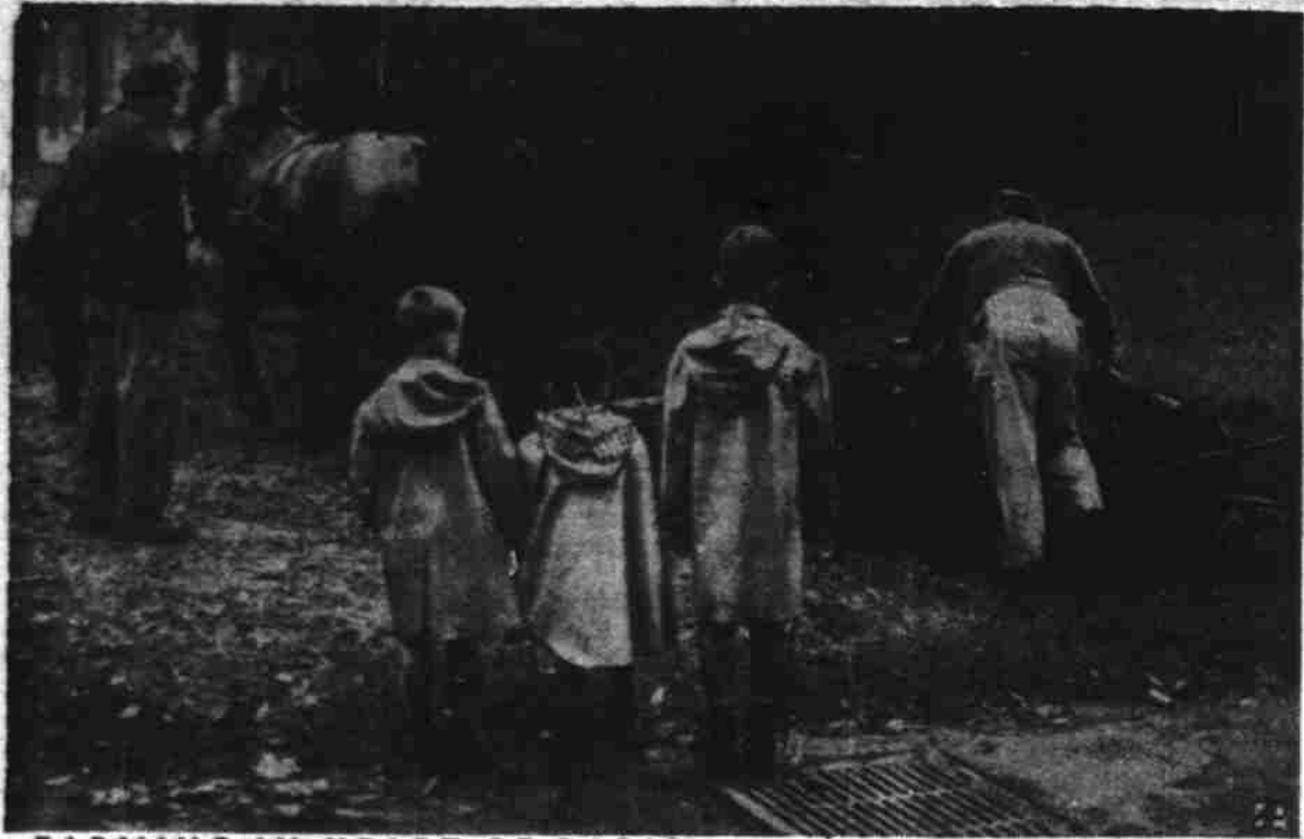
FARMING IN HEART OF PARIS—A rundown lawn in middle of Paris near Avenue of Champs Elysees is plowed for planting in this scene in French Capital.